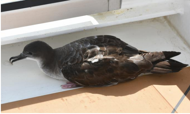
Shearwater on balcony, Sea Day 27/12/17