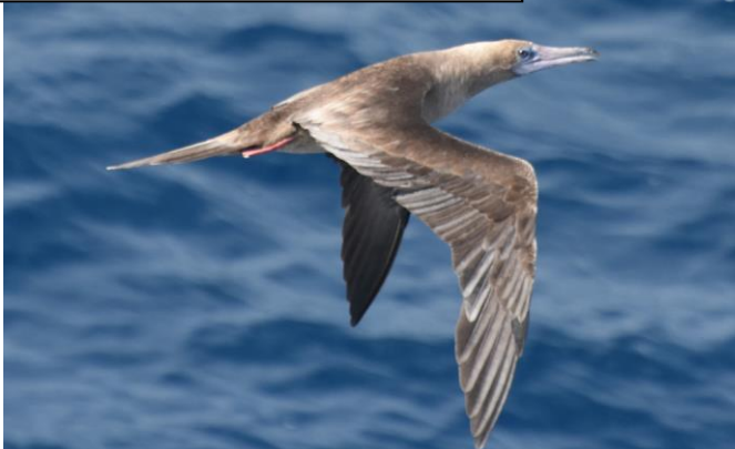
Red-footed Booby, Sea Day 25/12/17