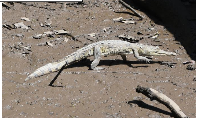
Crocodile, Costa Rica