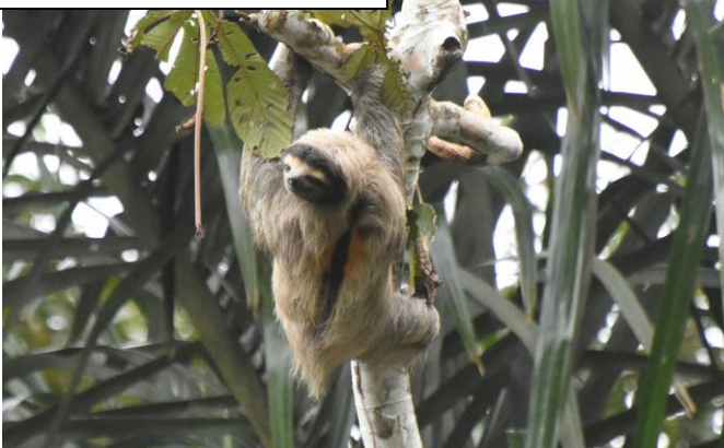
Three-toed Sloth, Costa Rica