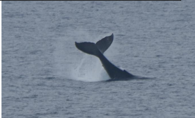
Humpback Whale tail slapping, Sea Day 03/01/18