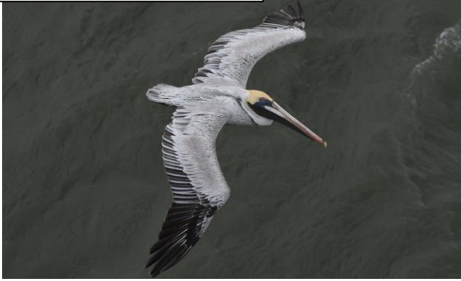
Brown Pelican, Panama Canal