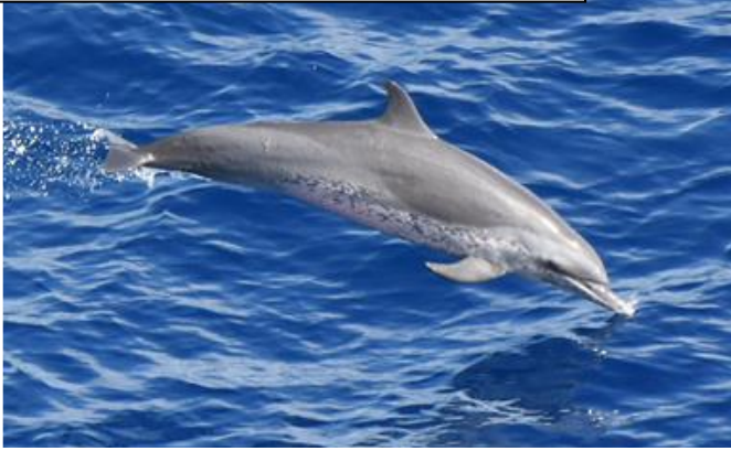
Pantropical Spotted Dolphin, leaving Cuba