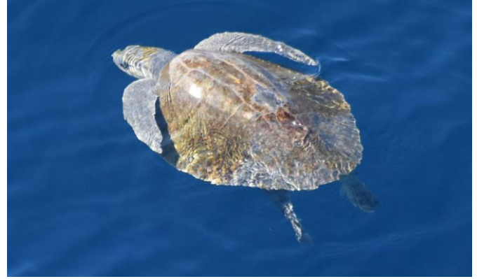
Sea Turtle, Sea Day 30/12/17