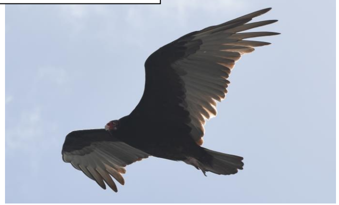
Turkey Vulture, Panama