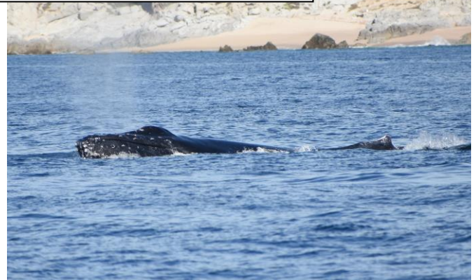
Humpback Whale, Cabo San Lucas