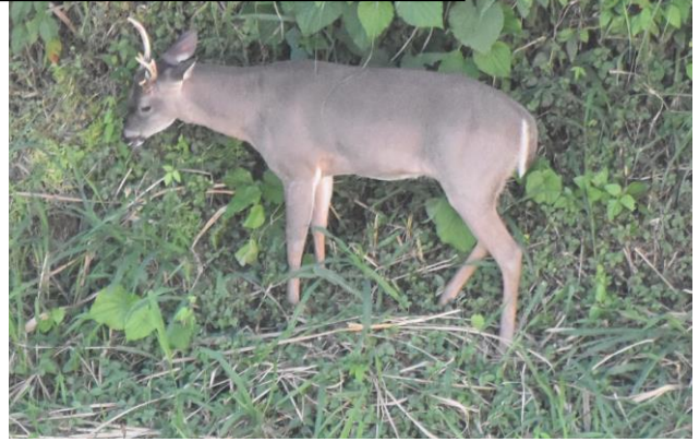
White-tailed Deer, Panama Canal