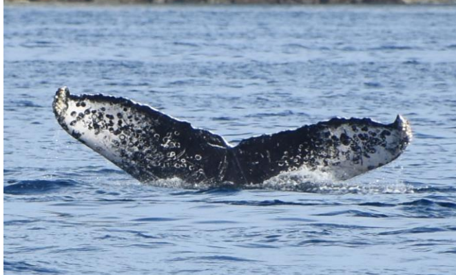
Humpback Whale Tail, Cabo San Lucas