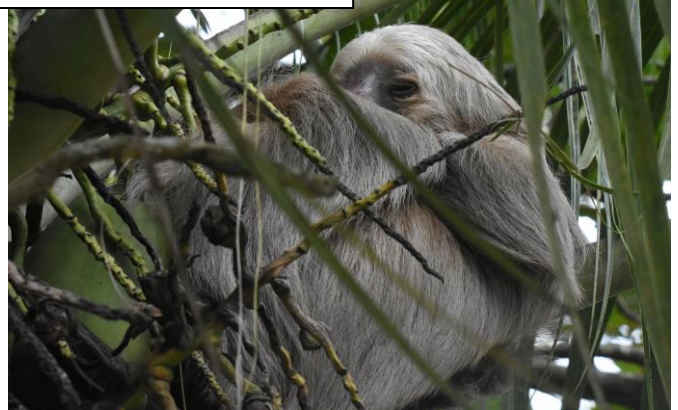
Two-toed Sloth, Costa Rica