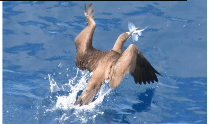
Brown Booby with Flying Fish, Sea Day 25/12/17