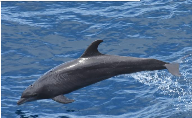
Bottlenose Dolphin, Sea Day 25/12/17