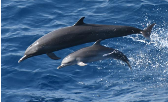
Pantropical Spotted Dolphin & calf, Sea Day 30/12/17