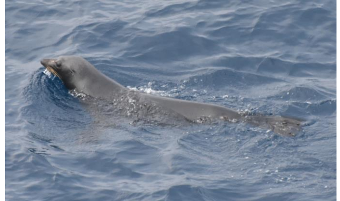
Guadalupe Fur Seal, Sea Day 31/12/17