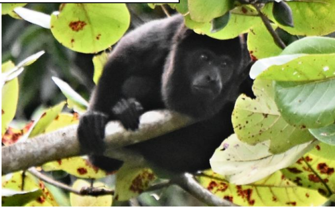
Howler Monkey, Costa Rica