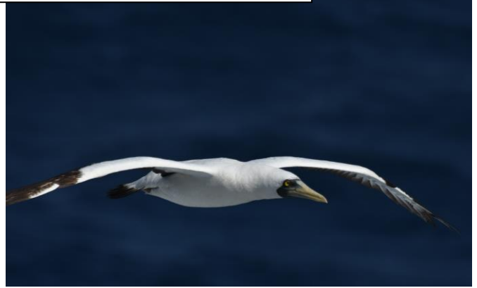
Masked Booby, Sea Day 21/12/17