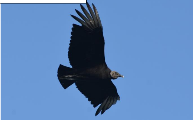
Black Vulture, Panama