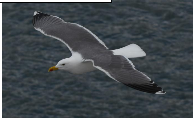
Yellow-legged Gull (12/03/18)