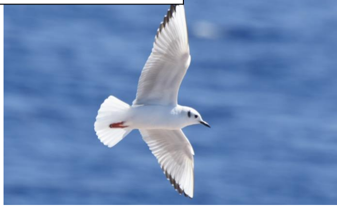
Bonaparte's Gull (06/03/18)