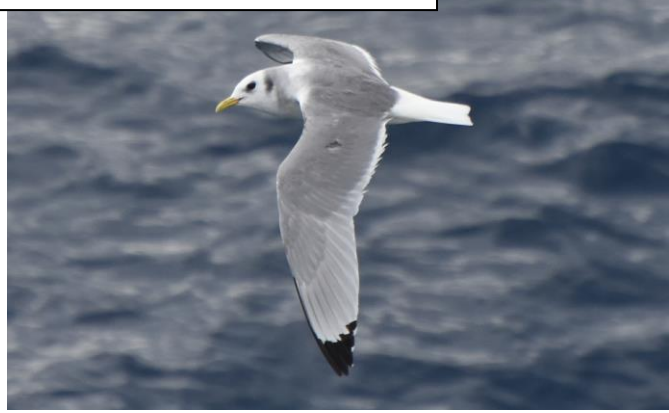
Black-legged Kittiwake (11/03/18)