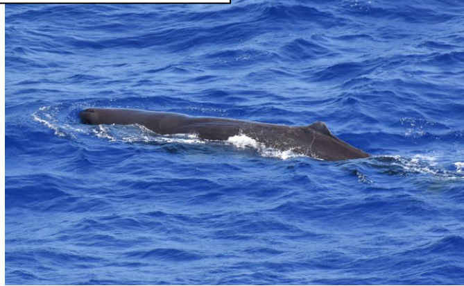
Sperm Whale (07/03/18)