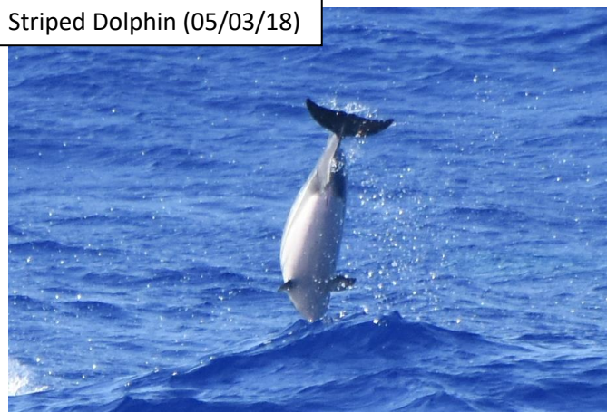
Striped Dolphin (05/03/18)