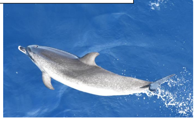
Atlantic Spotted Dolphin (11/03/18)