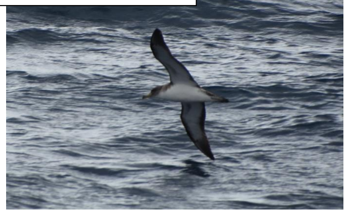
Cory's Shearwater (07/03/18)