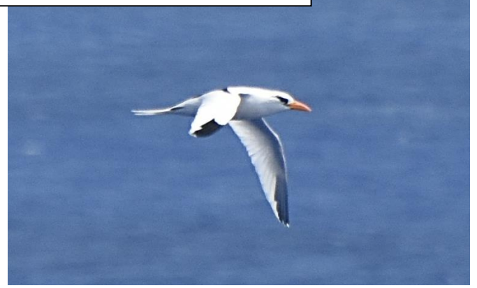
White-tailed Tropicbird (06/03/18)