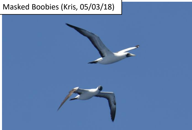
Masked Boobies (Kris, 05/03/18)