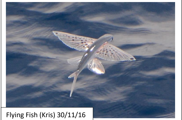
Flying Fish (Kris) 30/11/16