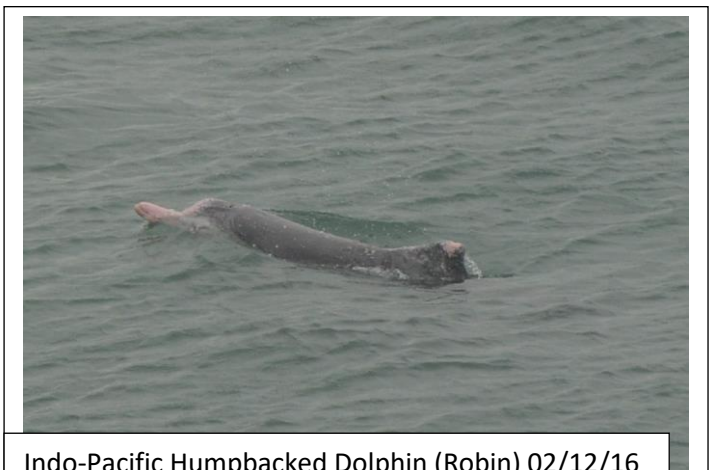
Indo-Pacific Humpbacked Dolphin (Robin) 02/12/16