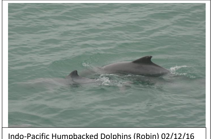
Indo-Pacific Humpbacked Dolphins (Robin) 02/12/16