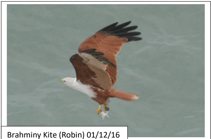
Brahminy Kite (Robin) 01/12/16