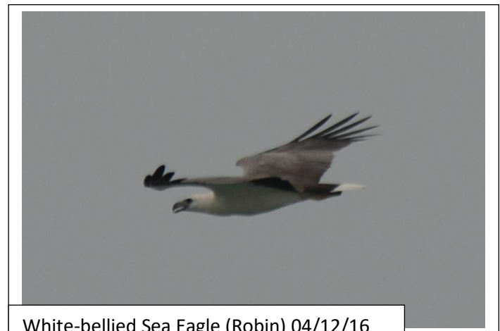
White-bellied Sea Eagle (Robin) 04/12/16