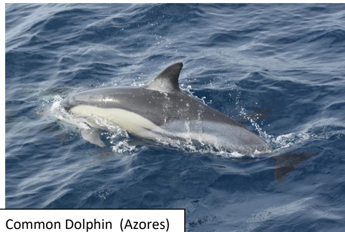
Common Dolphin (Azores)