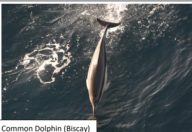
Common Dolphin (Biscay)