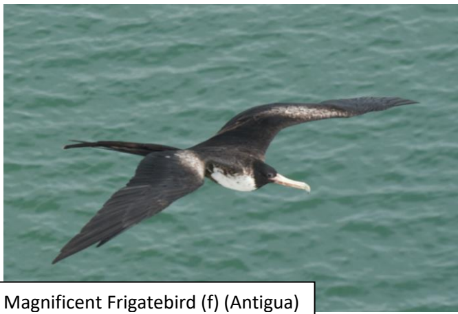
Magnificent Frigatebird (f) (Antigua)