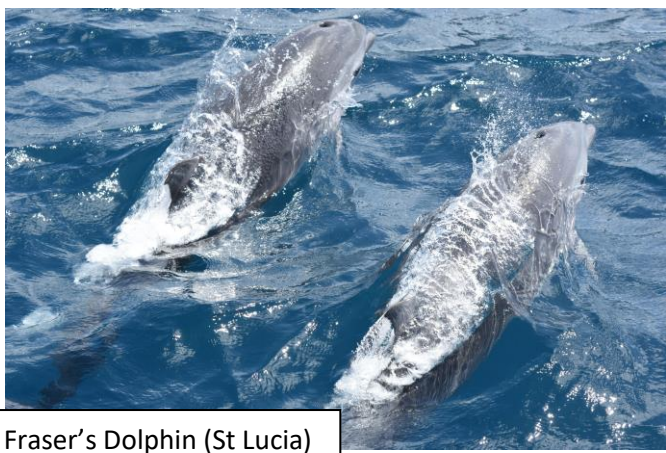
Fraser's Dolphin (St Lucia)