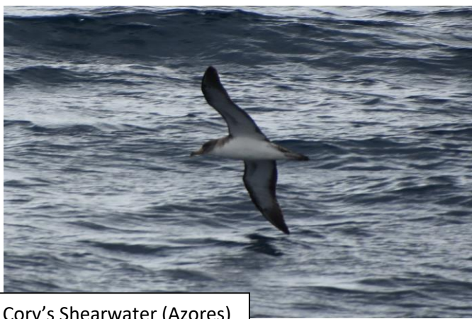
Cory's Shearwater (Azores)