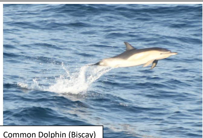
Common Dolphin (Biscay)