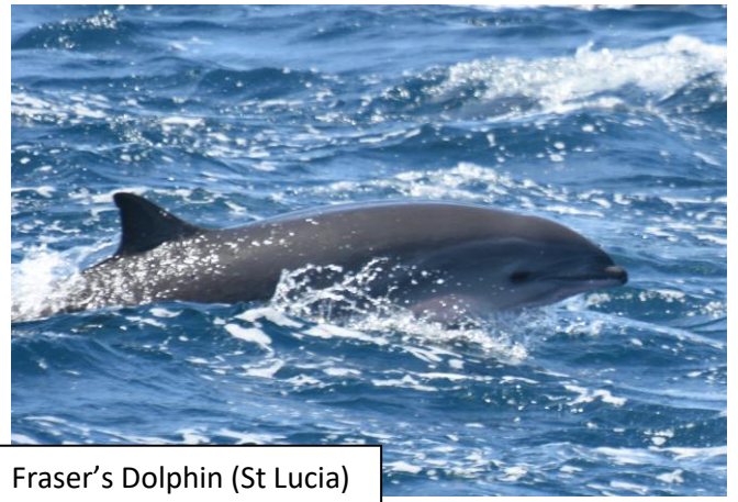
Fraser's Dolphin (St Lucia)